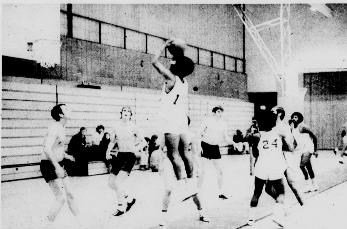
UCI FRESHMAN TEAM

The Anteaters now prepare to meet nationally ranked University of Hawaii, Friday and Saturday in Honolulu.